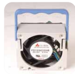
Optional 4 x middle hot-swap fan