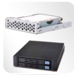
3 x 3.5" bays for FDD, SK41203 or SK51201