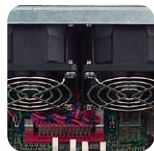
Enforcing 2 x rear 80mm fans