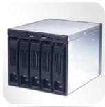
6 x 5.25" bays for ODD or storage kits