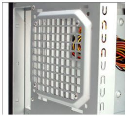
Wave Guide Design