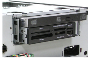
Slim ODD+3.5 extern